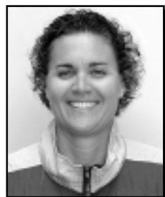
TERI McKEEVER Swimming-Women