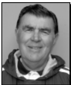
NORT THORNTON Swimming-Men