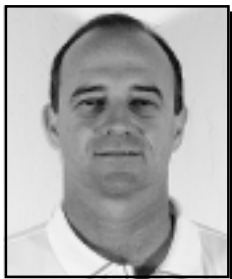
JEFF TEDFORD Football